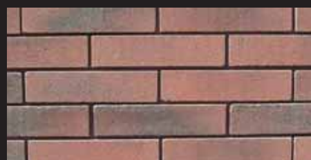
DARK RED BLEND