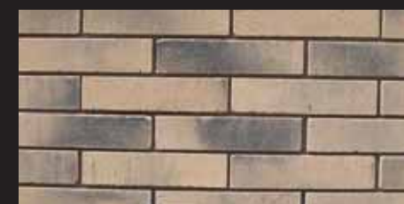
TIGEREYE WITH BROWN FLASH

The color of products shown within this brochure are as accurate as the photography and printing process will allow. We strongly recommend that your final color selection is based on actual samples.